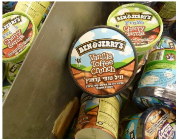
Ben & Jerry's ice cream sold in an illegal Israeli settlement in Palestine

*Read "Occupation, Inc.": http://www.hrw.org/node/285045