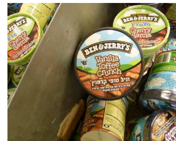
Ben & Jerry's ice cream sold in an illegal Israeli settlement in Palestine

*Read "Occupation, Inc.": http://www.hrw.org/node/285045